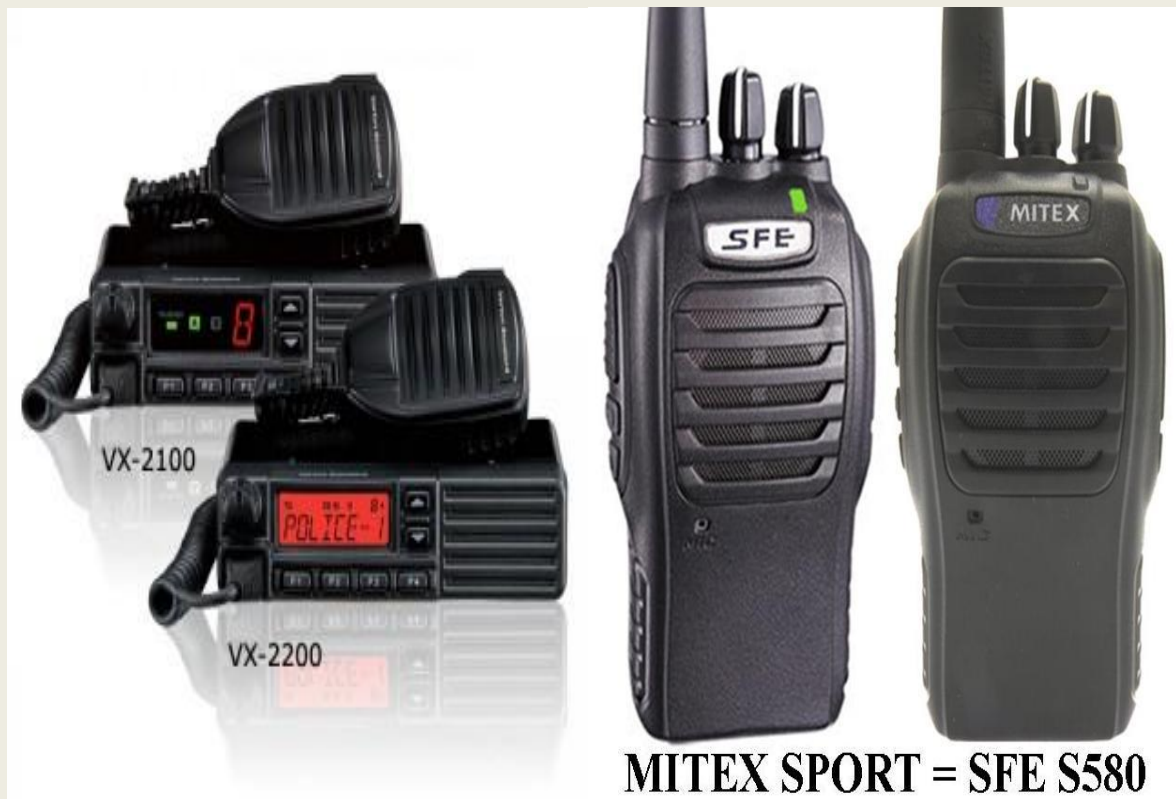
MITEX SPORT = SFE S580

PRETORIA NORTH RESIDENTS ASSOCIATION RADIO HANDLEIDING